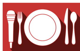
CATHOLIC MEN'S LUNCHEON CLUB

Throughout the Bible, God's people are reminded to care for those in need. Everyone needs food, clothing, and shelter. Even if we don't have much, we should use what we do have to help others. Whether it is providing a sandwich at St. Lawrence Haven or a warm winter coat at the SVDP Clothing Distribution Center, small things can make a difference.